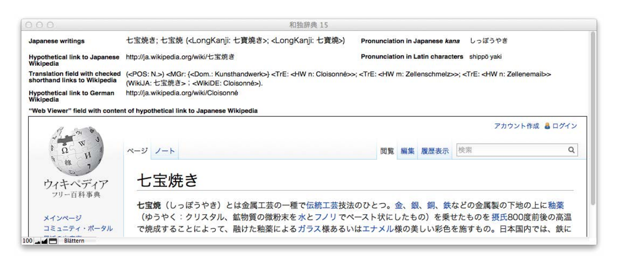
Figure 3: Screenshot of the database interface for working on links to the Japanese and German Wikipedia .

The process of finding correspondent Wikipedia articles can be automated to a certain extend, although orthographic variety of Japanese makes this process more difficult. Sometimes, several trials with different orthographical forms are necessary. Names of plants and animals for example are written in katakana characters within the Japanese Wikipedia – as is customary with scientists in the domain of biology – while many traditional dictionaries use kanji writings. The WaDokuJT project tries to give the most frequent Japanese writing first. Doing so, it is possible to generate automatically links for example to the Wikipedia with high probability to work correctly.