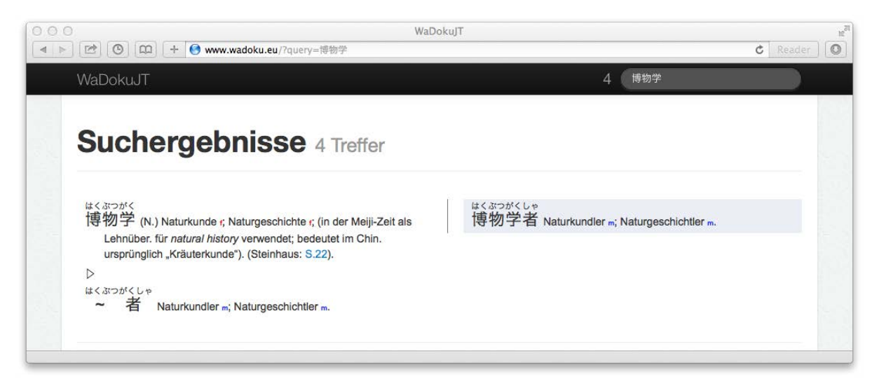
Figure 4: Web interface of WaDokuJT, displaying an entry with hyperlink to Steinhaus Kleines Wörterbuch zur Japanischen Archäologie – Japanisch-Deutsch (2010) at Google Books.

The WaDokuJT project has obtained an electronic version of the book from the author and now points from one WaDokuJT entry to the corresponding page of the archaeological dictionary. With this information, one can also generate a hyperlink which opens the dictionary page in Google Books .